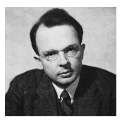
Figure: Rudolf Carnap