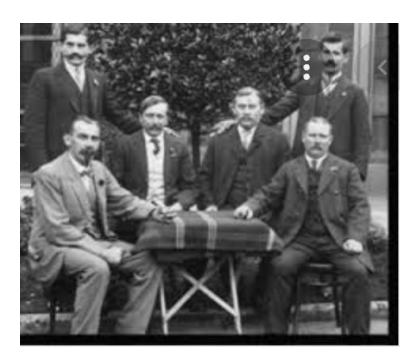
Figure: Vienna Circle