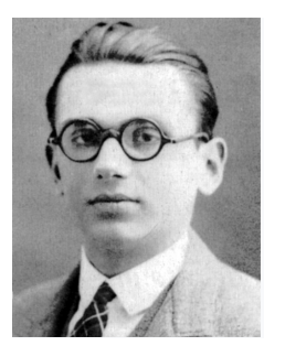
Figure: Kurt Gödel