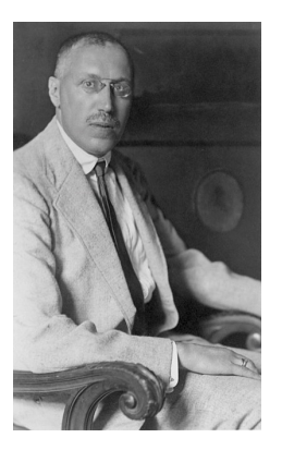
Figure: Hans Hahn